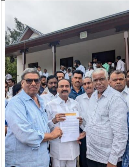
Representation Submitted to Sri Etala Rajender ji, Honourable Member of Parliament, Medchal Malkajgiri Constituency.