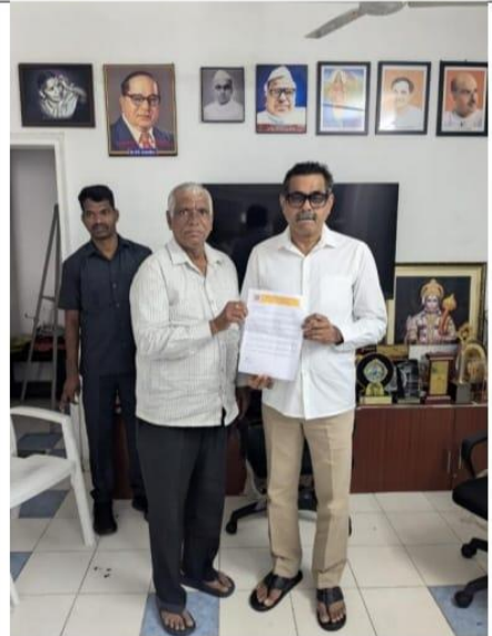
Representation submitted to Sri Shri Konda Vishwashwar Reddy ji, Honourable Member of Parliament (Lokasabha), Chevella Constituency